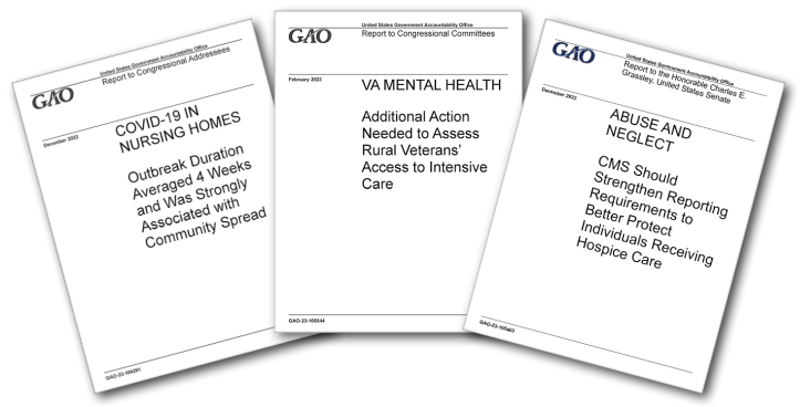
Figure 5: Examples of Reports on Health Care Challenges

Health Care Spending. The health and economic effects of COVID-19 have intensified concerns about the increasing number of people affected by behavioral health conditions—mental health and substance use disorders—and in need of treatment. In March 2022, we found that consumers with coverage for mental health care experience challenges finding in-network providers and in getting approval for some mental health services, limiting their ability to access services. In FY 2023, we will continue to provide information on behavioral health. Ongoing work is looking at the behavioral health services provided at some small, rural hospitals; intensive mental health care provided to rural veterans; and access to mental health care provided to service members separating from active duty.