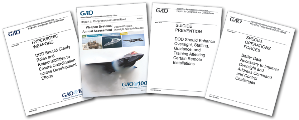
Figure 4: Examples of Reports on Defense Capabilities

National Security Enterprise. The U.S. Military is required to deploy its forces and conduct military operations across the globe, potentially at a moment's notice. The war in Ukraine underscores the potential for threats that challenge the international order and jeopardize global security. GAO's work has identified significant challenges that have hindered DOD's preparedness, including those affecting personnel, weapon systems and other equipment, and training. For example, GAO's work has highlighted significant maintenance and other sustainment challenges leading to numerous military aircraft not meeting mission capable goals.