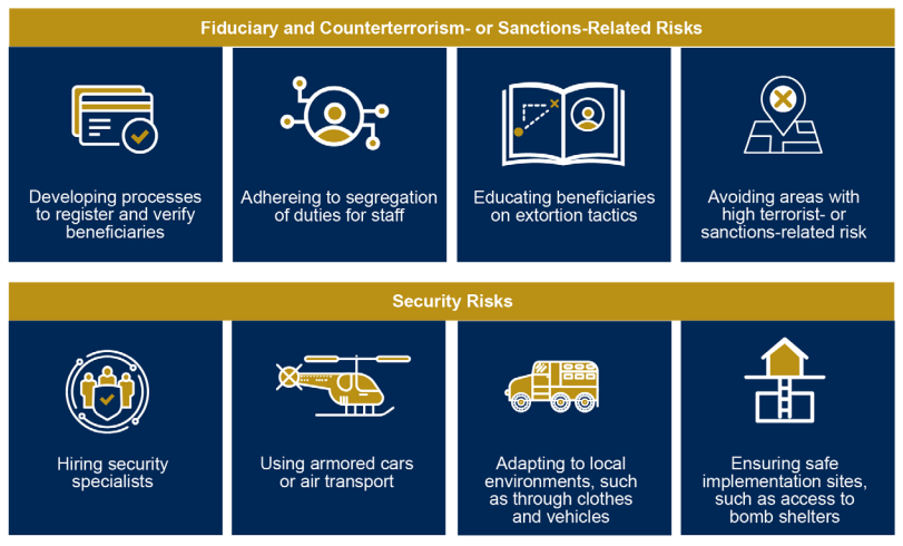
Figure 2: Examples of USAID Implementing Partners' Controls to Manage Fiduciary, Counterterrorism- or Sanctions-Related, and Security Risks in Nigeria, Somalia, and Ukraine