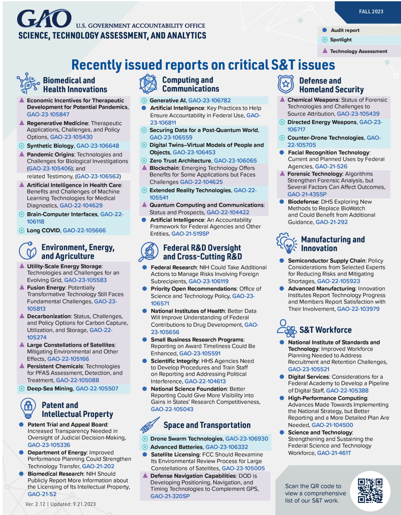
Figure 4: Examples of Recently Issued Reports on Critical Science and Tech Issues (including Technology Assessments)