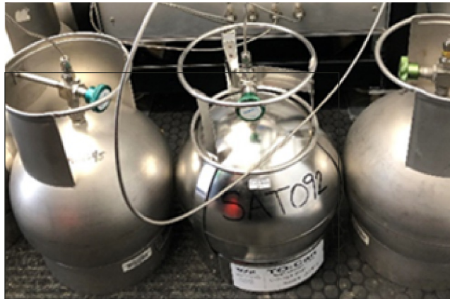
Figure 2: Example of Air Toxics Monitoring Equipment

Canisters used to collect samples for measuring air toxics operated by the Wisconsin Department of Natural Resources