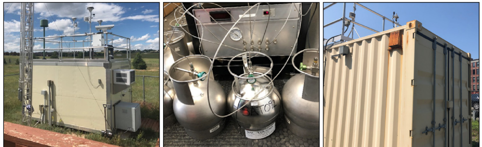
(Left to right) National Core network (NCORE) monitoring site; canisters used to collect samples for measuring air toxics; near-road monitoring site.