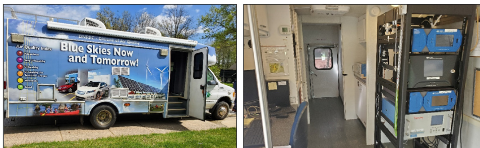
Exterior and interior of a mobile monitoring unit operated by the Delaware Department of Natural Resources and Environmental Control