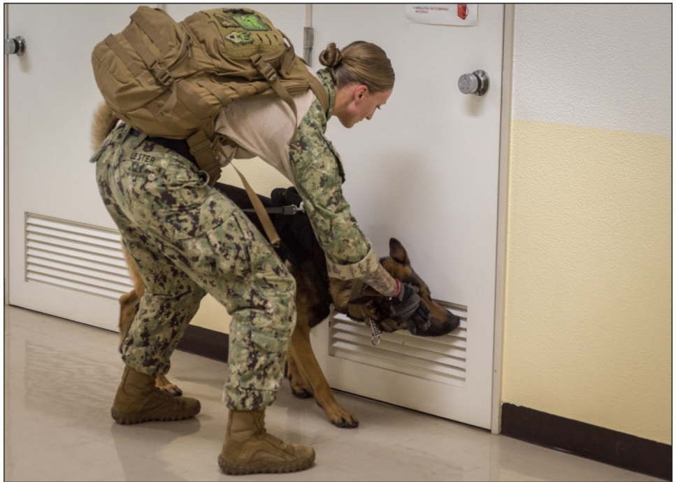
Figure 3: Military Working Dog and Handler on Duty

Source: Defense Visual Information Distribution Service. | GAO-19-178