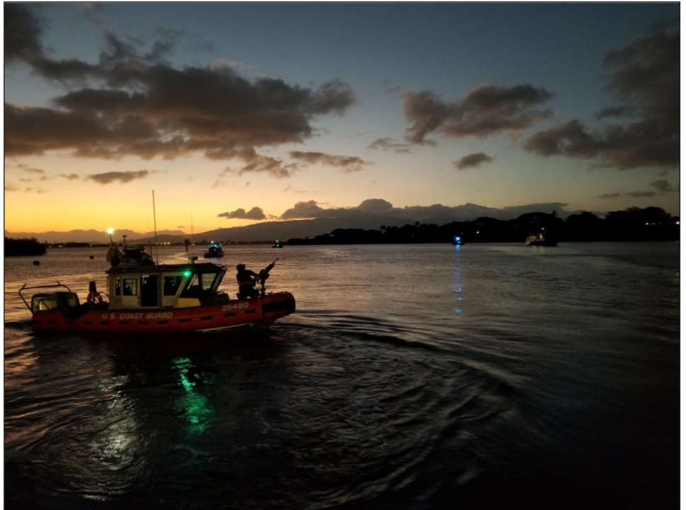
Figure 4: Coast Guard Response Boat on Patrol

GAO-19-178