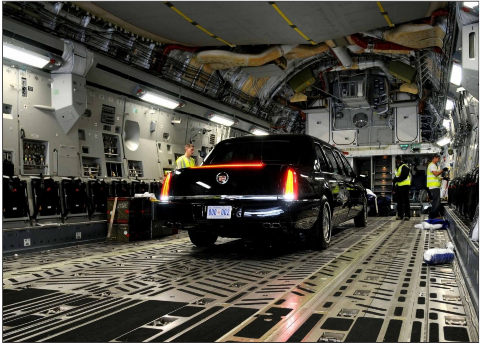
Figure 2: Presidential Limousine Loaded for Transport.

GAO-19-178