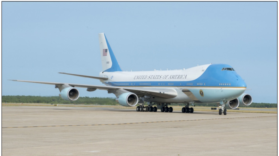
Figure 1: Air Force One

GAO-19-178