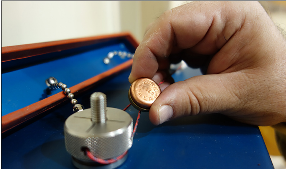
Figure 3: An Inspector Replaces a Seal

Source: IAEA Imagebank (03210500); Author: Petr Pavlicek. IAEA; license: https://creativecommons.org/licenses/by-sa/2.0/legalcode . | GAO-16-565