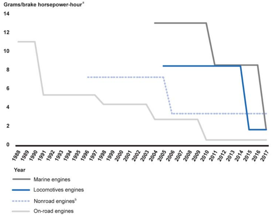
Figure 1: Effective Dates of Major Nitrogen Oxide Emission Limits for Newly Manufactured Mobile Sources of Diesel Emissions, by Source