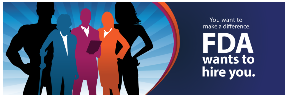
Figure 1: Example of FDA Recruiting Advertisement

Source: Food and Drug Administration (FDA) website, accessed on September 28, 2021 from https://www.fda.gov/about-fda/jobs-and-training-fda . | GAO-22-104791