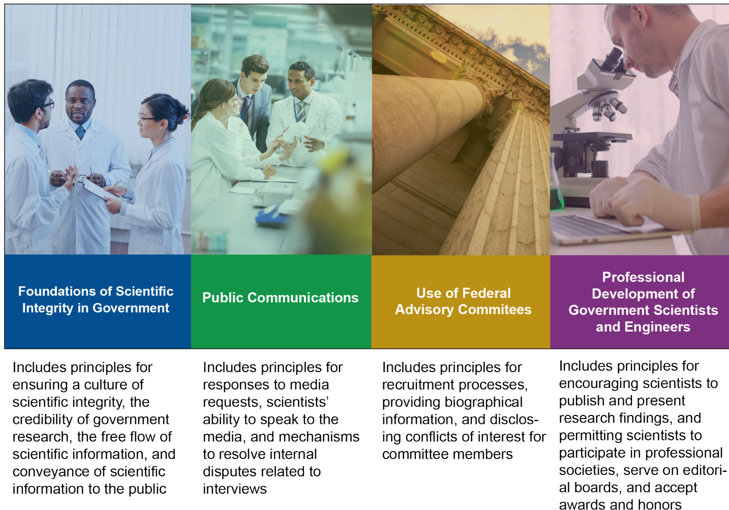
Figure 2: Pillars of Scientific Integrity as Defined by the Office of Science and Technology Policy (OSTP)

Sources: GAO (analysis), OSTP (information), PaulBradbury/koto/pressmaster/merrvas/Khwanchai/stock.adobe.com (images). | GAO-22-104613