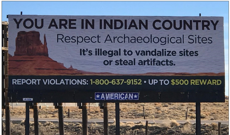
Figure 2: Bureau of Indian Affairs Billboard in Arizona Providing Information for how to Report Theft or Damage at Archeological Sites

GAO-21-110