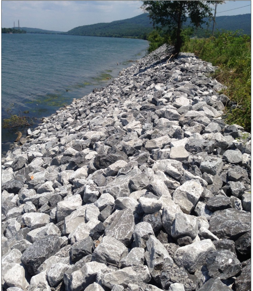
Figure 3: Tennessee Valley Authority Shore Stabilization Project, Gunterville Reservoir, Alabama

GAO-21-110