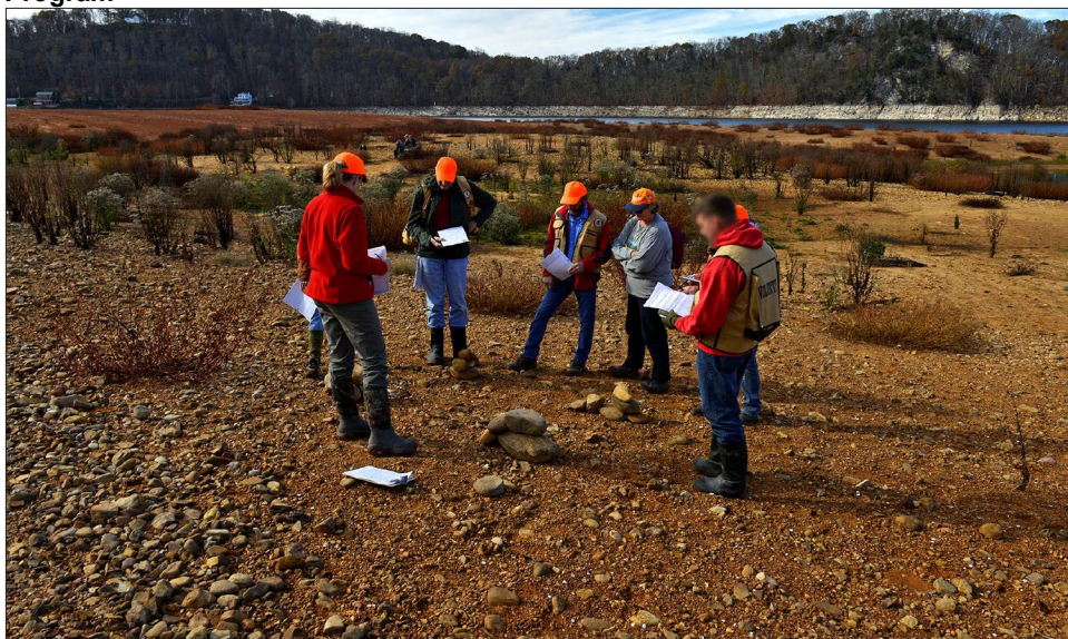
Figure 4: Volunteers Participating in the Thousand Eyes Volunteer Site Stewardship Program

Source: Tennessee Valley Authority. | GAO-21-110