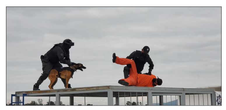
Figure 8: Mexican Government Security Officials Demonstrate Prison Canine Unit Capabilities