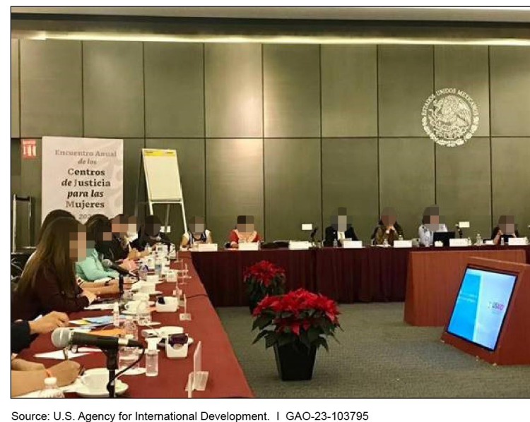
Figure 9: Annual Meeting of Women's Justice Centers

Human rights: Encompassed 12 projects with funding of $69.5 million from fiscal year 2019 through fiscal year 2021. USAID projects aimed to improve the Mexican government's capacity to prevent, investigate, and prosecute human rights abuses, while strengthening civil society to engage on human rights issues. Projects in this portfolio included human rights training and forensics equipment and training.