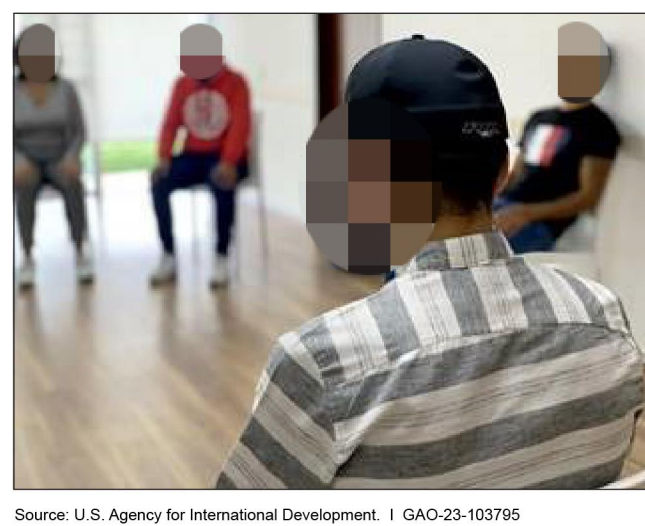
Figure 11: Youth Crime and Violence Prevention Program

Training for government officials: One project supported the Mexican government in improving the national crime and violence prevention policy through training, including training on crime and violence prevention. The project also focused on strategies to prevent genderbased violence and improve civic justice. The project reported that 2,952 individuals received training, including 1,123 individuals spanning 320 different public agencies.