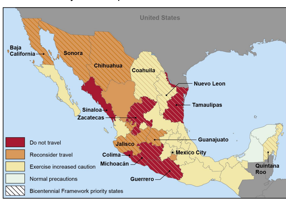
Figure 5: Map of Bicentennial Framework Priority States in Mexico and Travel Advisories Issued by the State Department

programming. USAID officials said they currently do not have programs in the states of Guerrero and Tamaulipas due to insecurity in these states and what they perceive as greater opportunities for impact in other states with USAID assistance. See figure 5 for a map of Mexican states with State Department travel advisories and the 12 Bicentennial Framework Priority States.