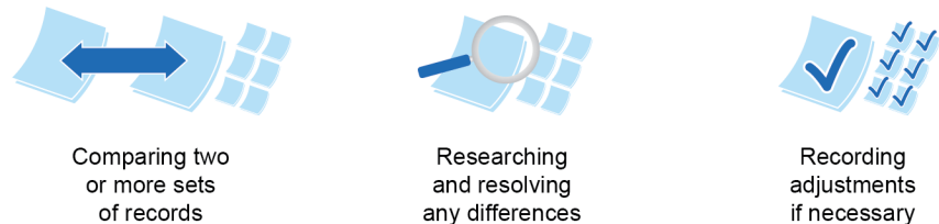
Figure 1: Three Steps of the Reconciliation Process

According to Standards for Internal Control in the Federal Government , management should design control activities to achieve objectives and respond to risks. Transaction control activities are actions management may build directly into operational processes to help the entity achieve its objectives and address related risks. 42 A reconciliation is a type of a transaction control activity. As shown in figure 1, a reconciliation consists of comparing two or more sets of records, researching and resolving any differences, and recording adjustments if necessary. Organizations are to perform reconciliations routinely to detect and correct any problems promptly and to not allow differences to age, thereby becoming increasingly difficult to research.