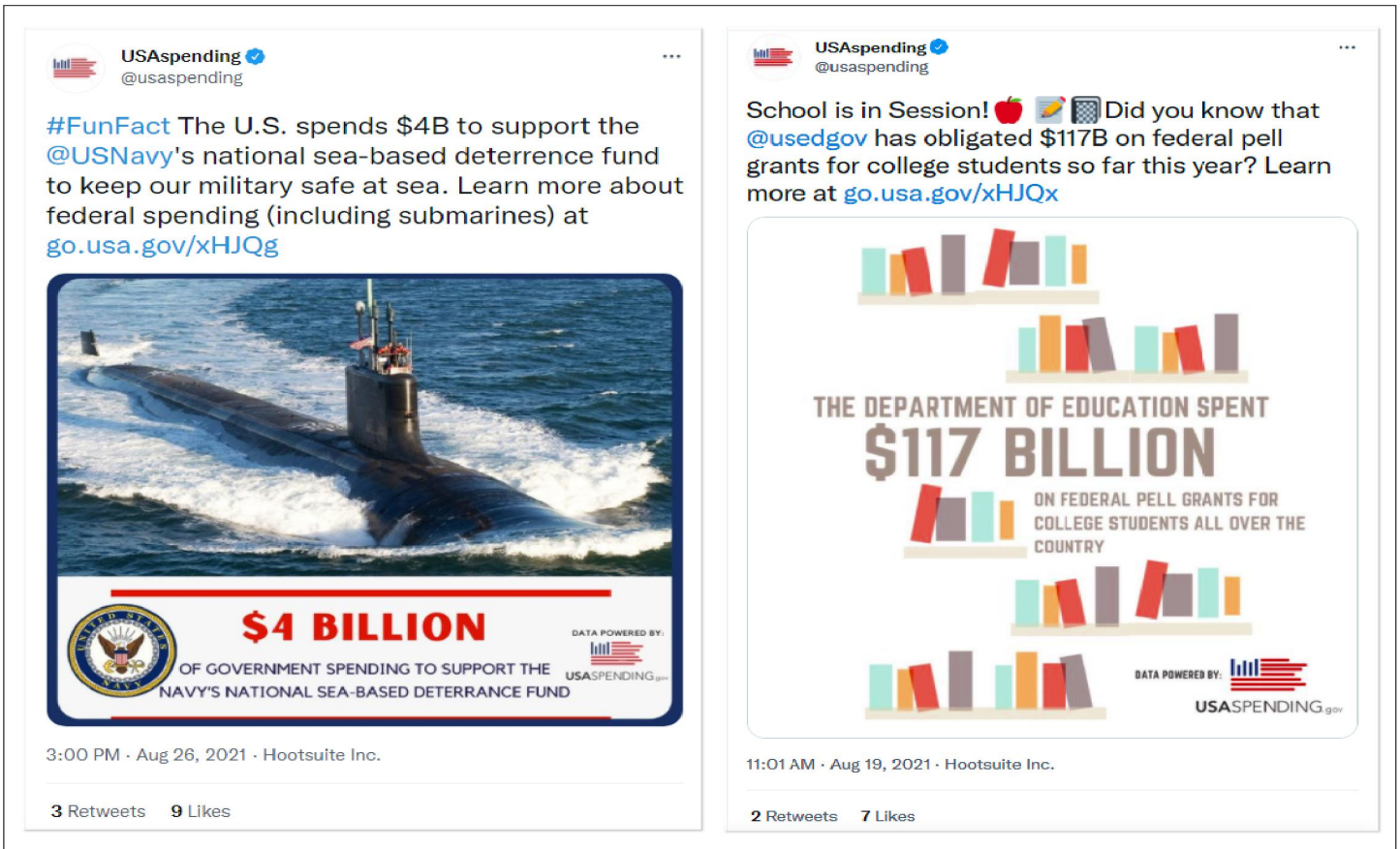
Figure 3: Examples of USAspending.gov Tweets

GAO-22-104127