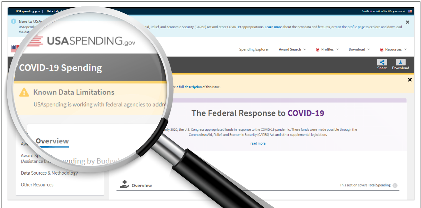
Figure 4: Screenshot of Earlier Version of USAspending.gov COVID-19 Spending Web Page

Source: Image created by GAO using screenshot of USAspending.gov COVID-19 Spending Web Page (June 1, 2021). | GAO-22-104127