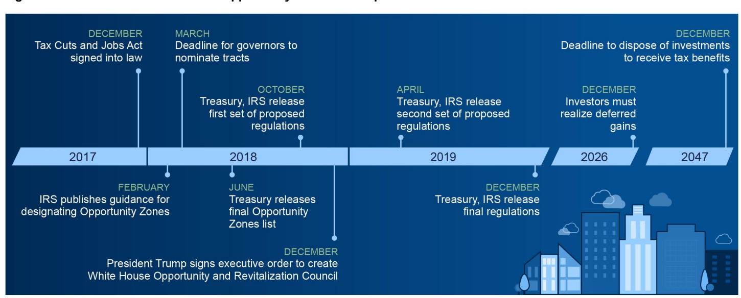
Figure 1: Selected Milestones for the Opportunity Zones Tax Expenditure

Source: GAO analysis of Department of the Treasury (Treasury) and Internal Revenue Service (IRS) regulations, Pub. L. No. 115-97, and E.O. 13853. | GAO-21-30