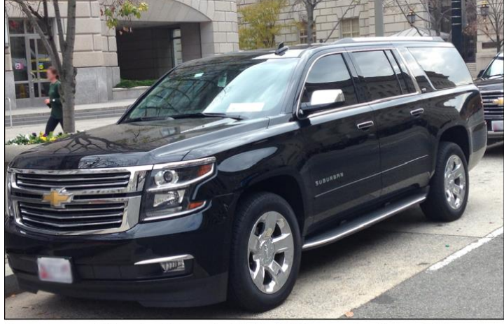
Department of Homeland Security (DHS) SUV executive fleet vehicle in Washington DC, purchased with an approved waiver from the General Services Administration (GSA).

GAO-17-426