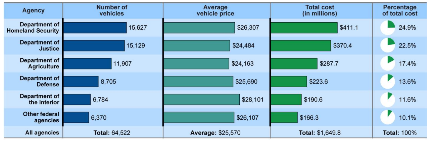
Figure 1: Passenger Vehicles and Light Trucks Purchased by Federal Agencies from Fiscal Year 2011 through Fiscal Year 2015, by Department

Source: GAO analysis of GSA's ROADS data from fiscal years 2011 through 2015. | GAO-17-426