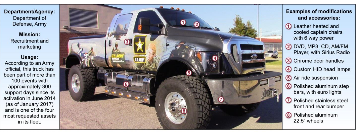
Figure 3: Vehicle purchased with a waiver submitted by Army

Army purchased a truck with a number of upgrades for $167,427, to be used for recruiting purposes, according to officials (see figure 3). Army officials noted that the upgrades contributed to its success as a recruiting tool, and that the truck was purchased as a replacement for six Hummers.