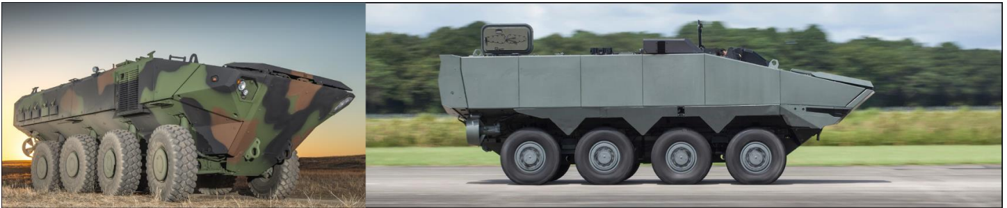
Figure 1: ACV 1.1 Prototype Vehicles

Source: (left to right) ACV 1.1 produced by BAE Systems Land & Armaments, L.P., © BAE Systems, Inc. and ACV 1.1 produced by Science Applications International Corporation, © SAIC (images). Images provided by Marine Corps Systems Command. | GAO-17-402