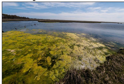
An algal bloom appears on the water's surface at Assateague Island National Seashore, Maryland.