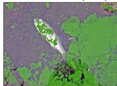
A cyanobacteria (also called blue-green algae) bloom on Binder Lake, Iowa, caused a fish kill.

Sources: Eric Vance, Environmental Protection Agency (left); Jennifer L. Graham, U.S. Geological Survey (right). | GAO-17-119