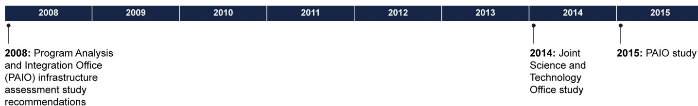
Figure 3: Timeline of the Chemical Biological Defense Program (CBDP) Enterprise’s Limited Progress in Identifying Required Infrastructure Capabilities

GAO-15-257