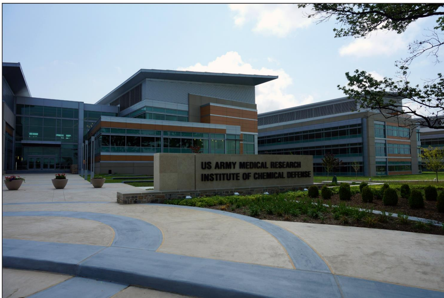
Figure 6: United States Army Medical Research Institute of Chemical Defense's New Headquarters and Laboratory Facility

Source: U.S. Army Medical Research Institute of Chemical Defense. | GAO-15-257