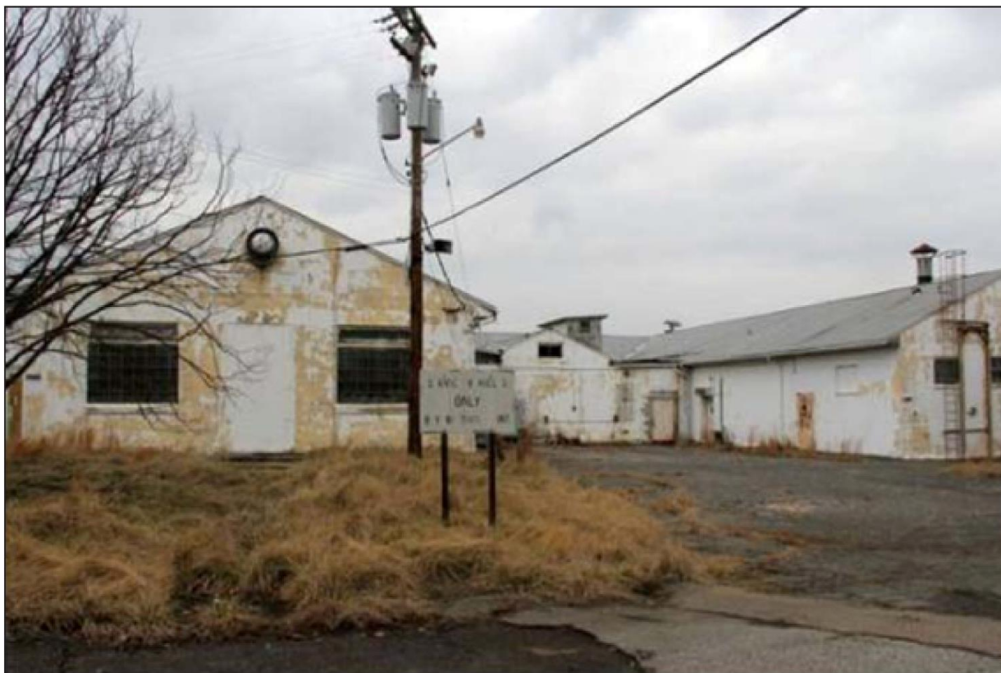
Figure 4: Example of an Abandoned Edgewood Chemical Biological Center Facility (Building 3222 Medical Research Laboratory)

Source: U.S. Army Edgewood Chemical Biological Center. | GAO-15-257