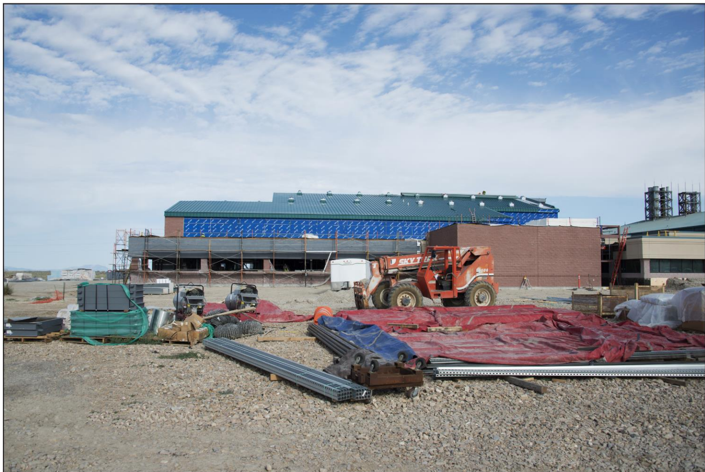
Figure 9: West Desert Test Center's Life Sciences Test Facility Annex

GAO-15-257