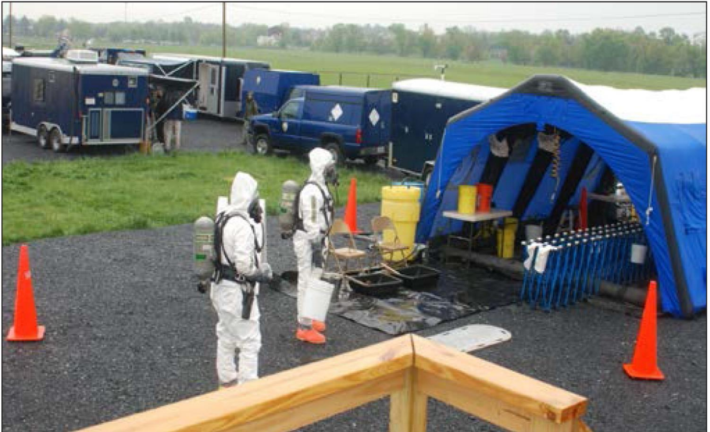
Figure 7: United States Army Medical Research Institute of Infectious Diseases (USAMRIID) Field Training Exercise

GAO-15-257