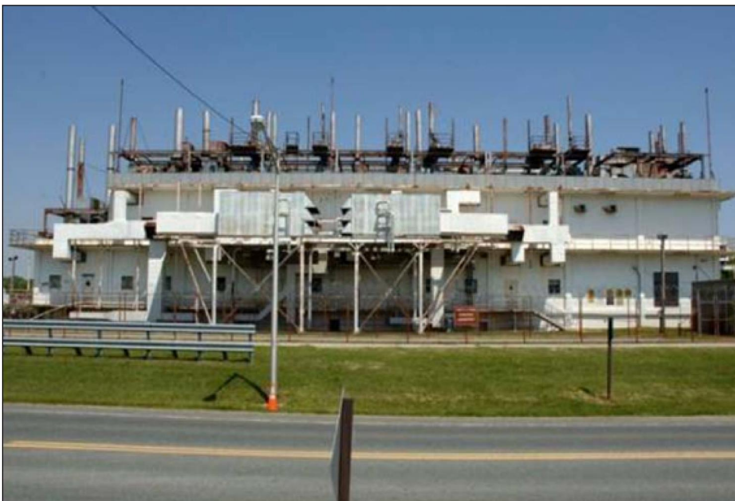
Figure 5: Example of an Abandoned Edgewood Chemical Biological Center Facility (Building 3300 Chemistry Laboratory)

GAO-15-257